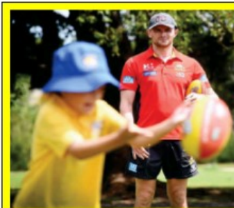
GC Suns Visit & AFL Clinics