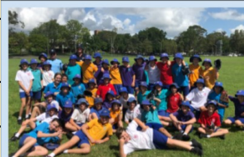
Marist Brothers Baseball Clinics